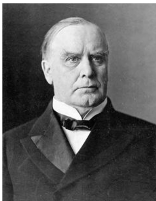
William McKinley, 25th President March 4, 1897 - September 14, 1901