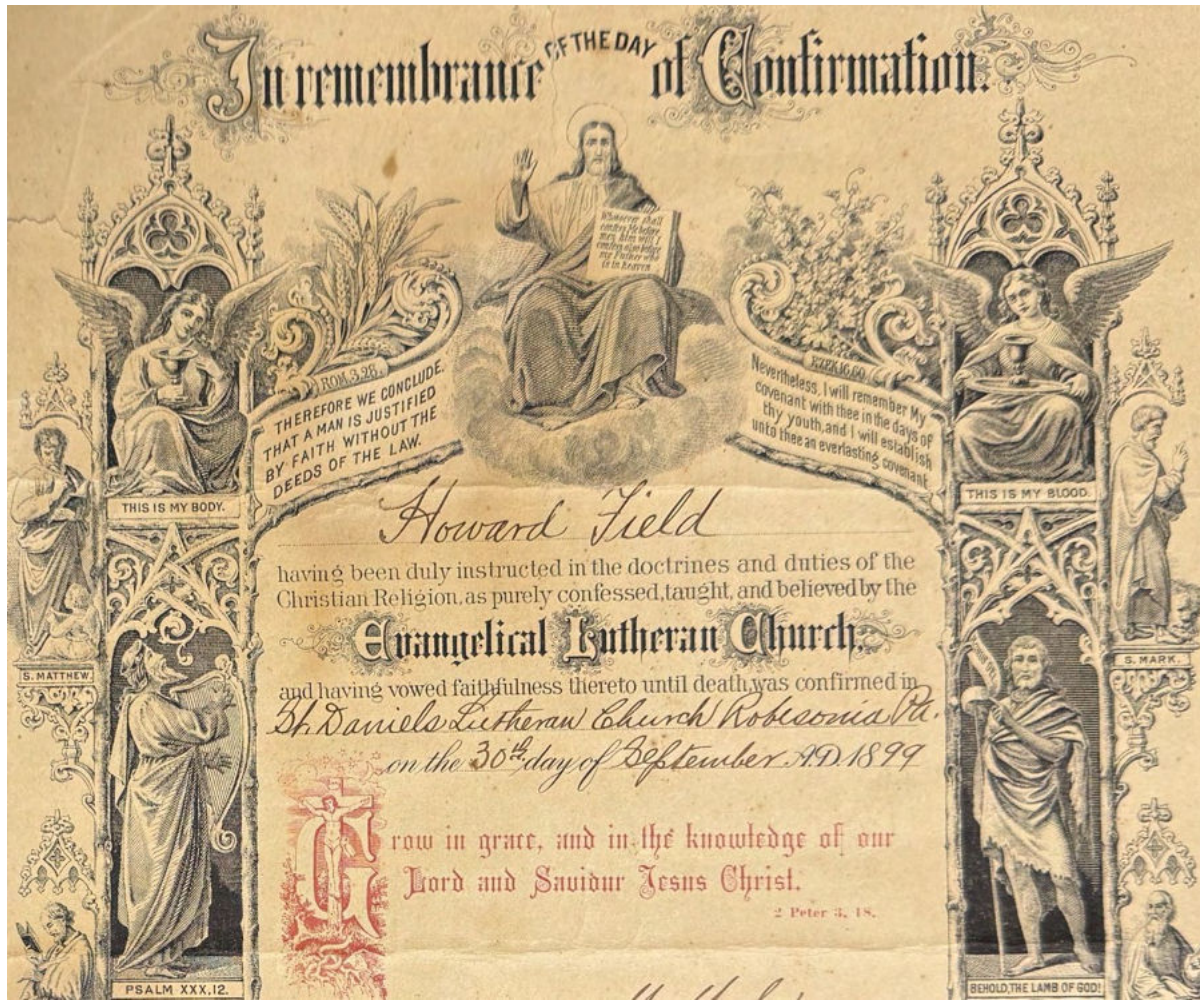
Closer view of the top of the Confirmation certificate.