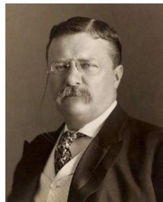
Theodore Roosevelt, 26th President September 14, 1901 - March 4, 1909