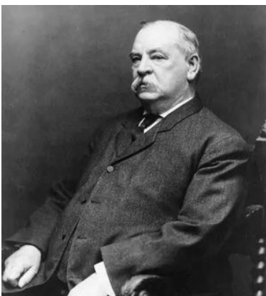
Grover Cleveland, 24th President (2 nd term) March 4, 1893 – March 4, 1897