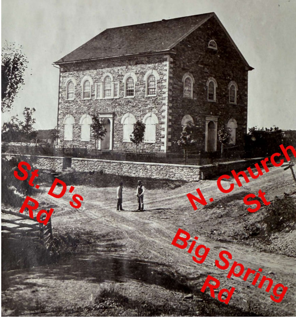
An easy way to understand the location of the second church building!