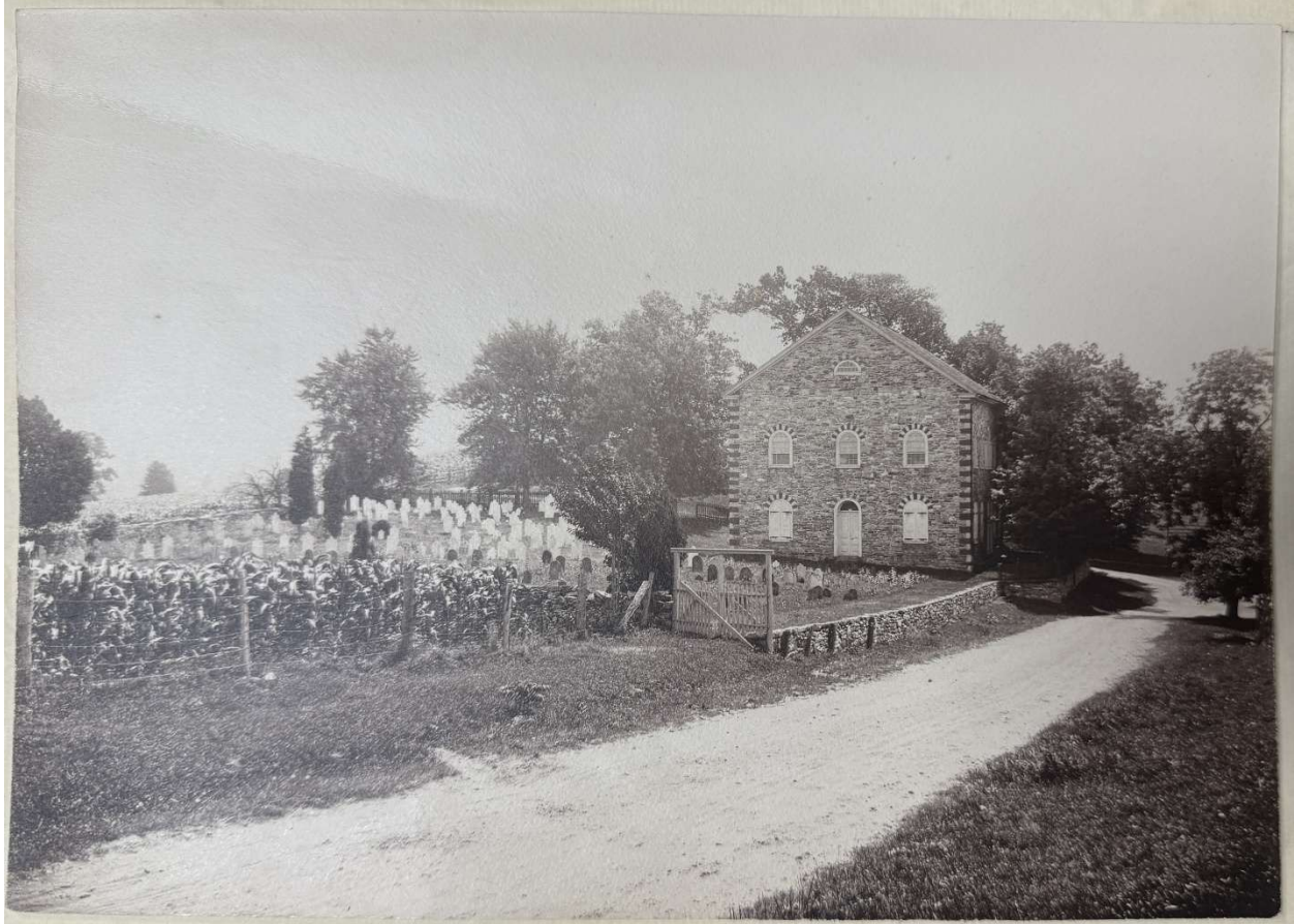
Another view of the church from what would currently be St. Daniel's Road. The present St. Daniel's church building would be diagonally across to the right.