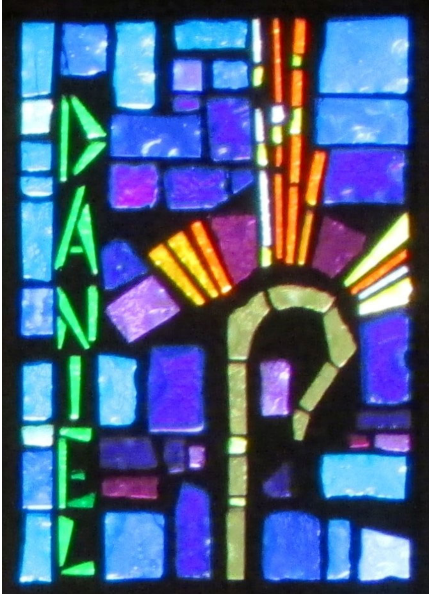
Upper section of the stained glass panel referencing Reverend "Daniel" Ulrich