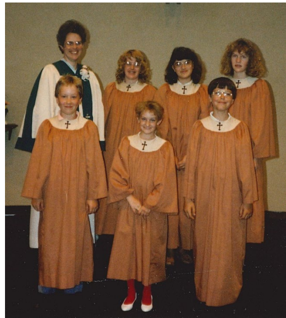
Junior Choir at Easter - undated