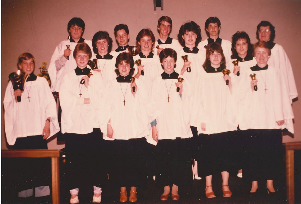
“Tintinnabulators” Bell Choir – undated photo