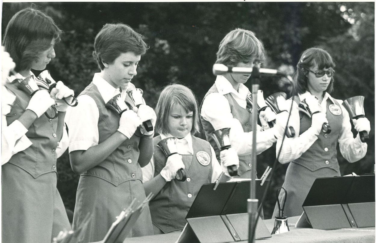
Concentration on display as the “Tintinnabulators” play – August 20, 1978