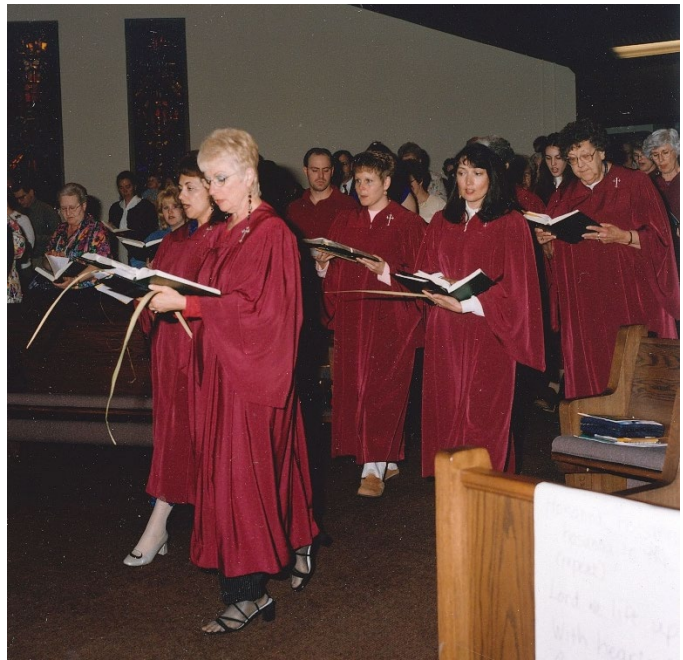
Choir processional on Palm Sunday - 2000