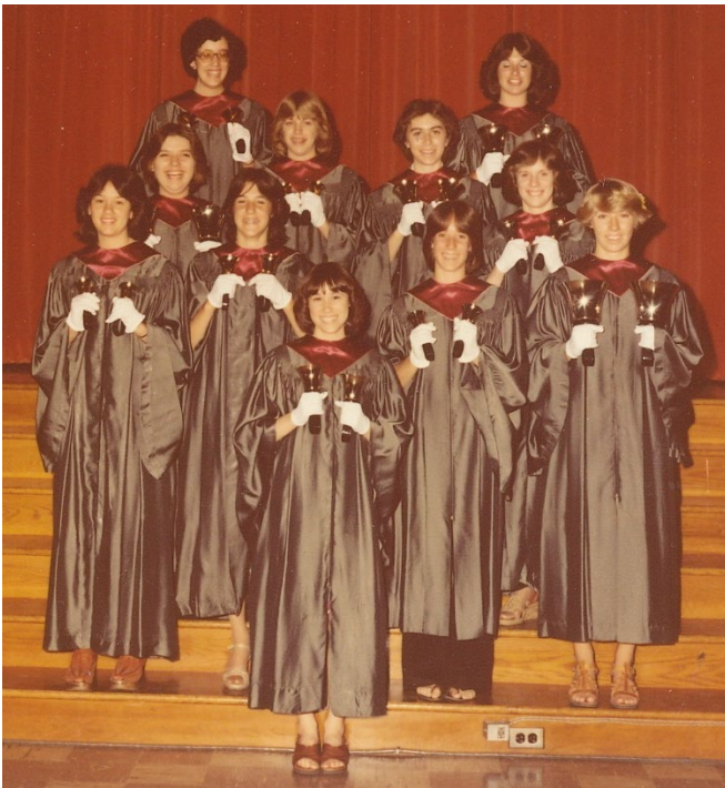
1978 - Bell Choir at Conrad Weiser High School with bells rescued from the church fire