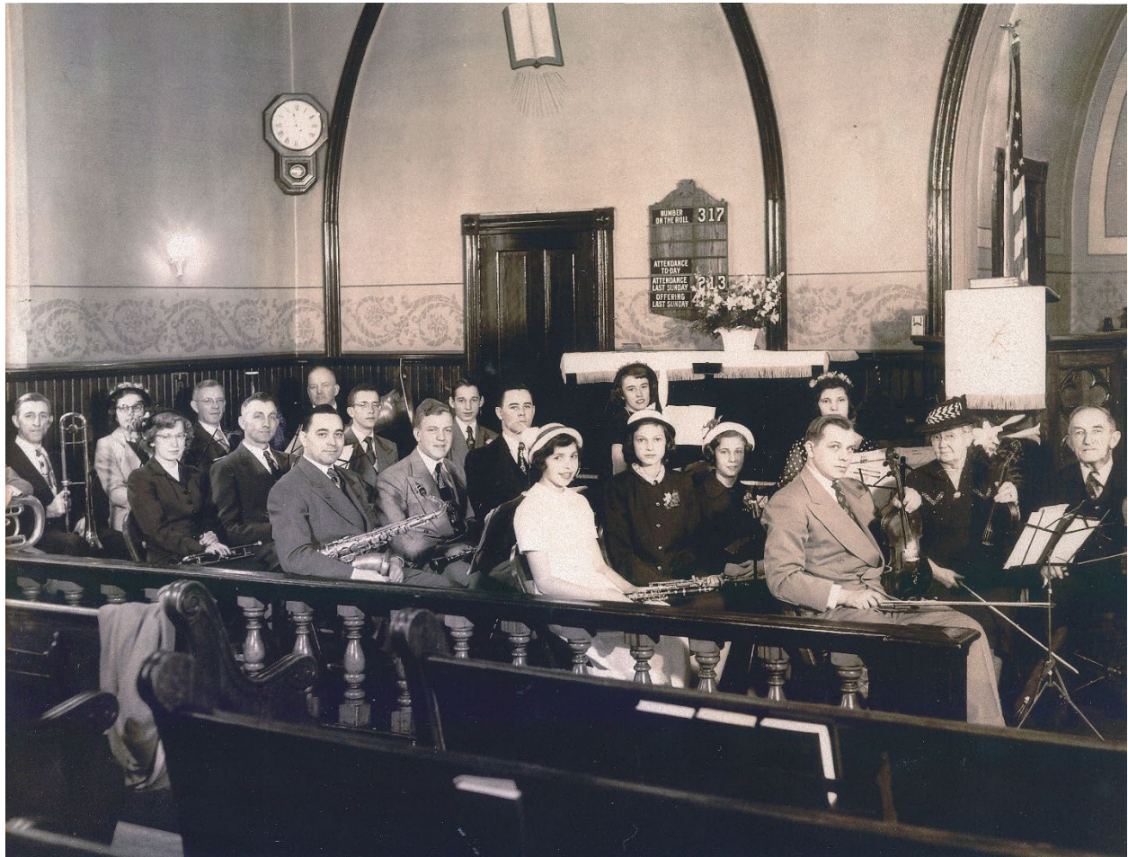
Sunday School Orchestra – early 1950s

Our amazing Director of Music 2014 - present