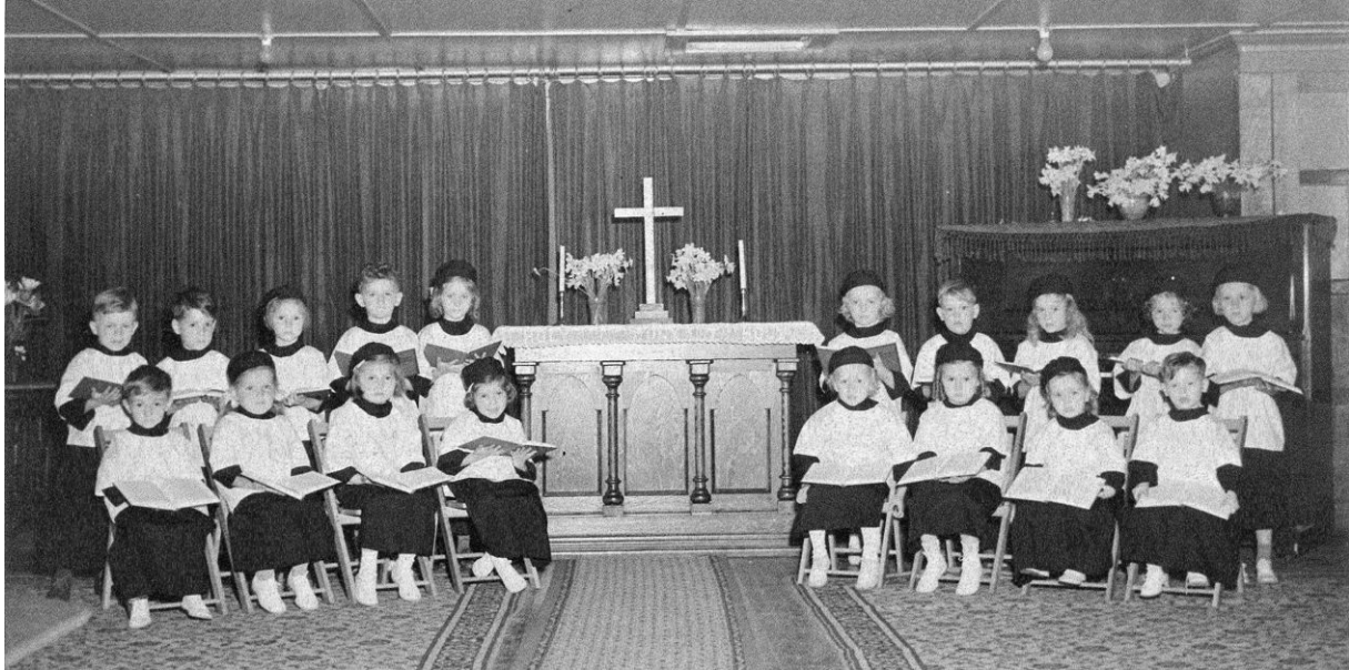
Baby Choir – Mother’s Day 1941