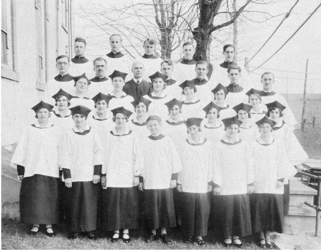
Choir - 1924