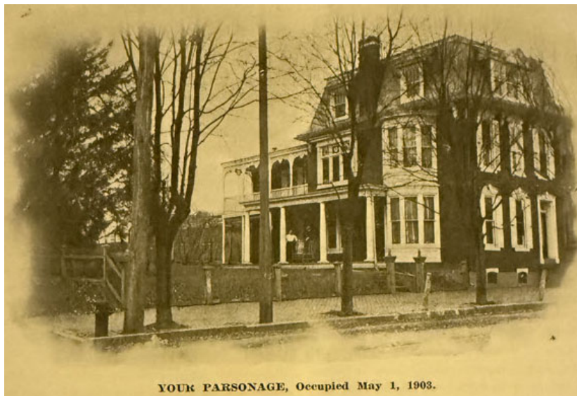
From the 1912 Parish Record.

#StDaniels #StDanielsLutheranChurch #EckKirche #CornerChurch #OnTheHillOverlookingRobesonia #RobesoniaPA #1751StDaniels2026 #275thAnniversary #HolyHighlights #History #OurHistory #Parsonage #ALotHappensIn275Years