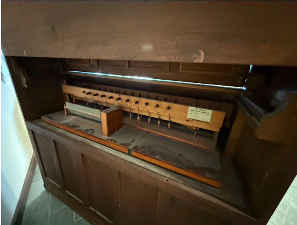
The back cover has been removed from the organ.