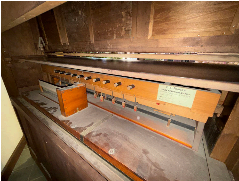
View of the inside from the back.