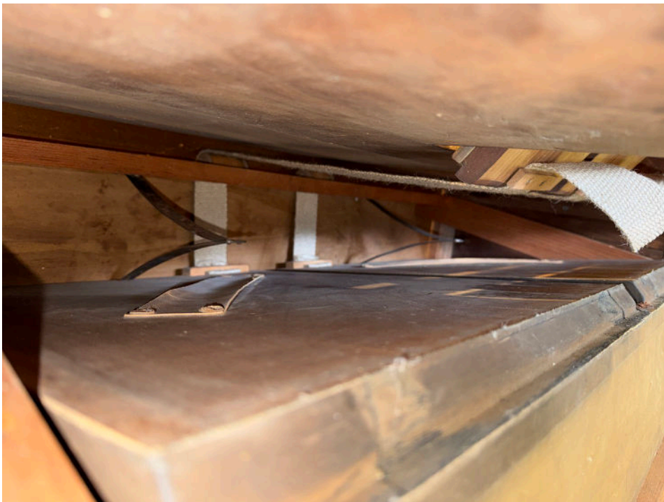
Both straps have been replaced and attached to the pedals. The angled pointed metal pieces are the hinges for the bellows when the pedal is pushed.