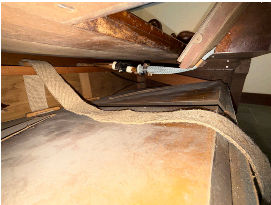
Left strap (light brown) replaced but not yet attached to the pedal. Take a look at the concoction someone previously put together to repair the right strap (brown and gray)!