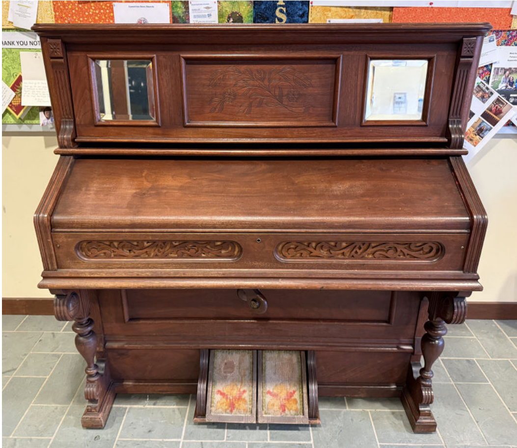
The organ has been fixed and is ready to be played, just in time for the 275 th Anniversary service honoring our music heritage!