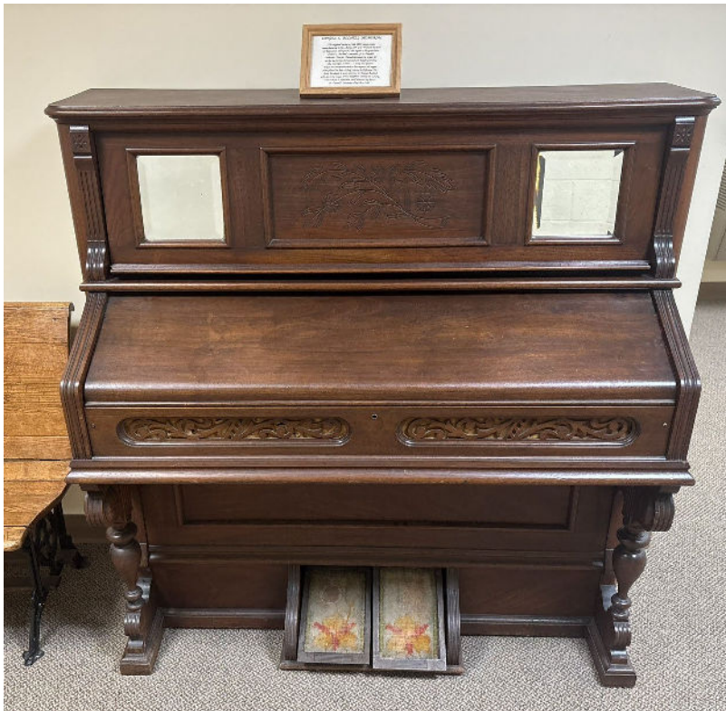
The Daniel S. Bechtel Memorial Pump Organ, built in 1897. In this photo, the left pedal is not functional.