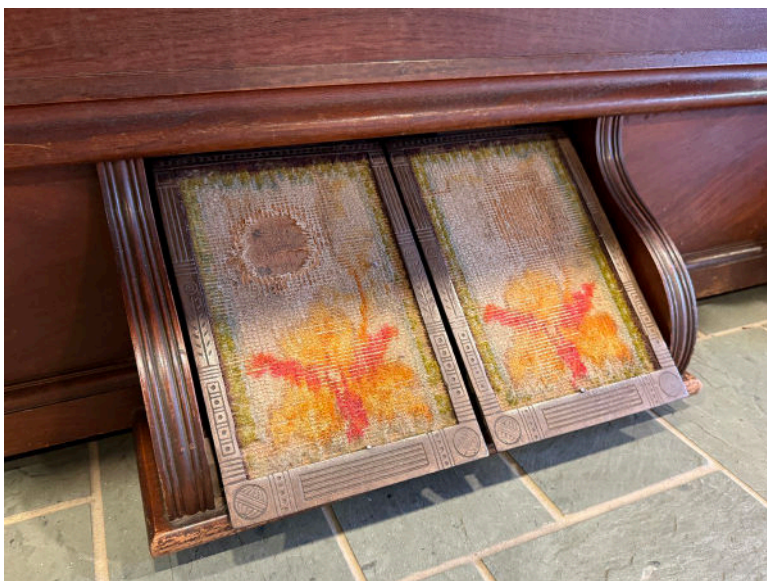
Fancy – and now functional – foot pedals.