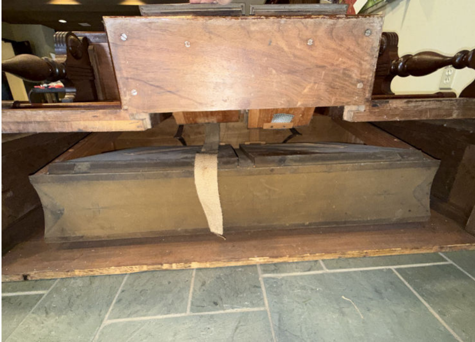
The organ is laying on its back. This is the view of the bellows from underneath.