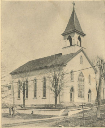
St. Daniel's Church