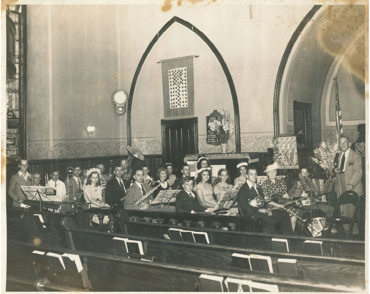
1947 photo from the 1948 Parish Record – captioned “St. Daniel’s Famous 22”