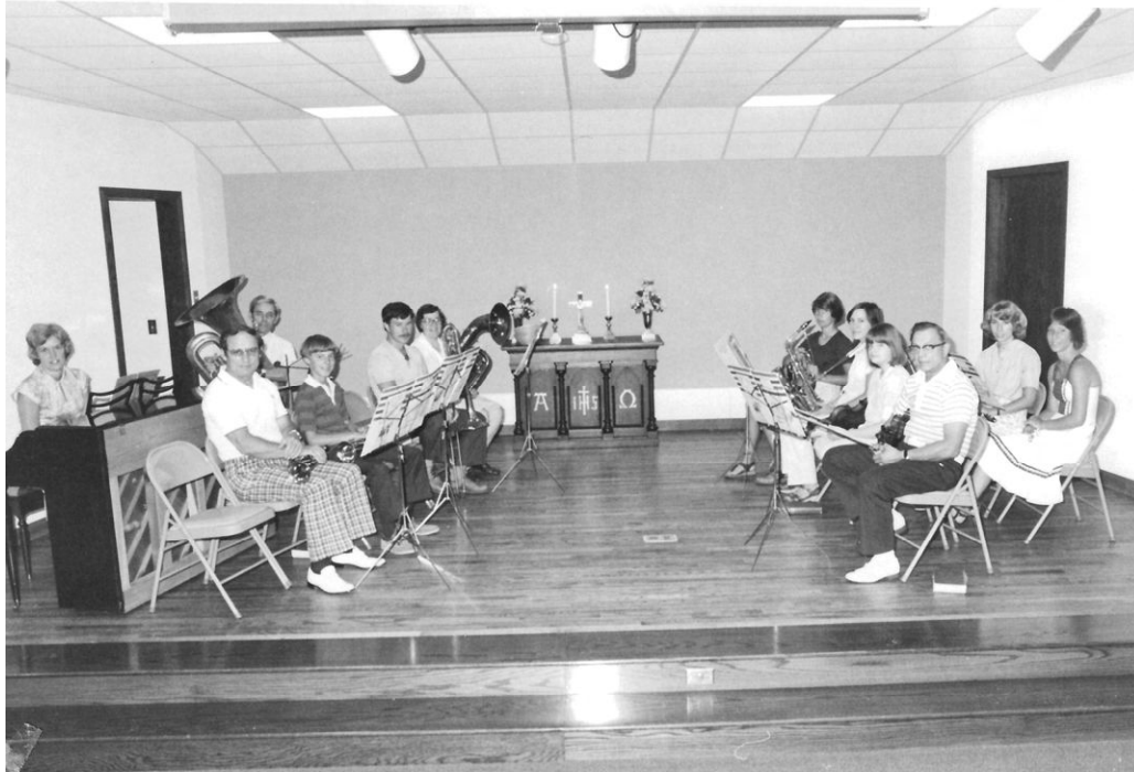
Sunday School Orchestra on the Social Hall stage – 1980