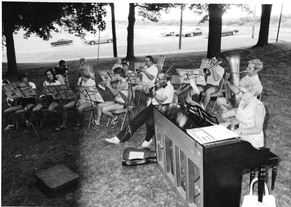
Sunday School Orchestra – 1980