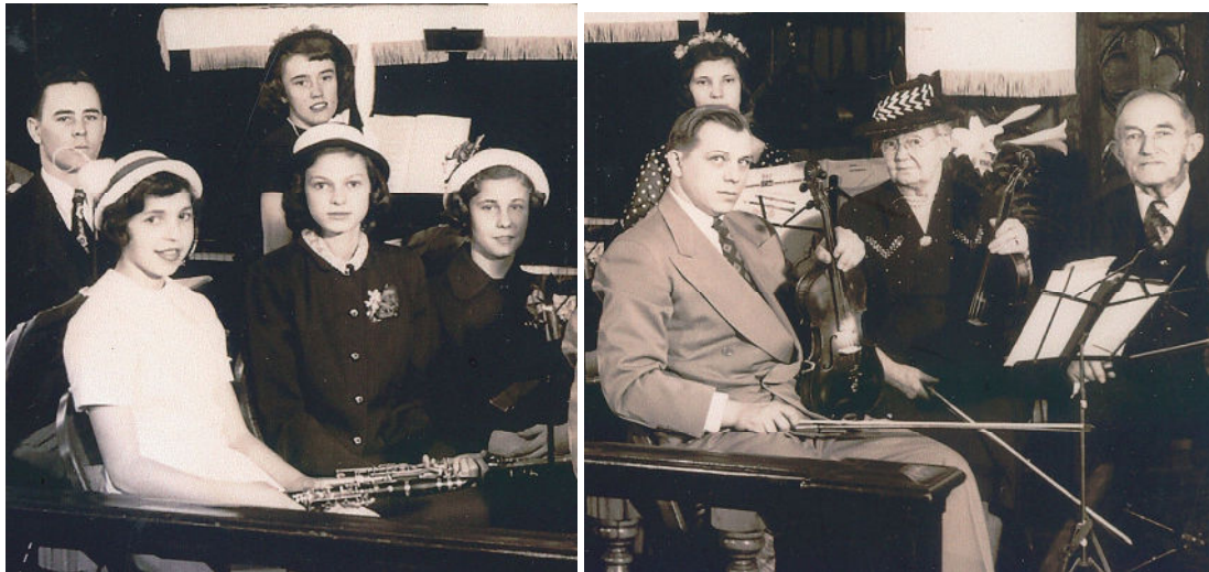
Clearer, larger views of the 1951 Orchestra members!